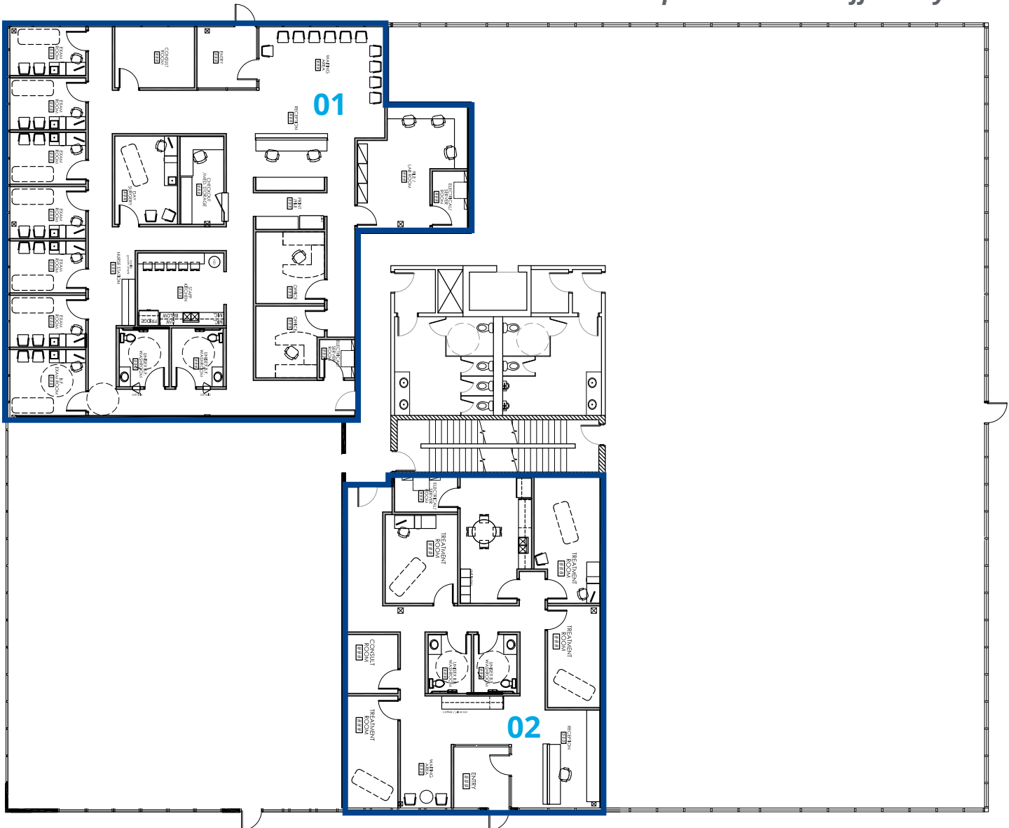
Proposed Medical Office Layout